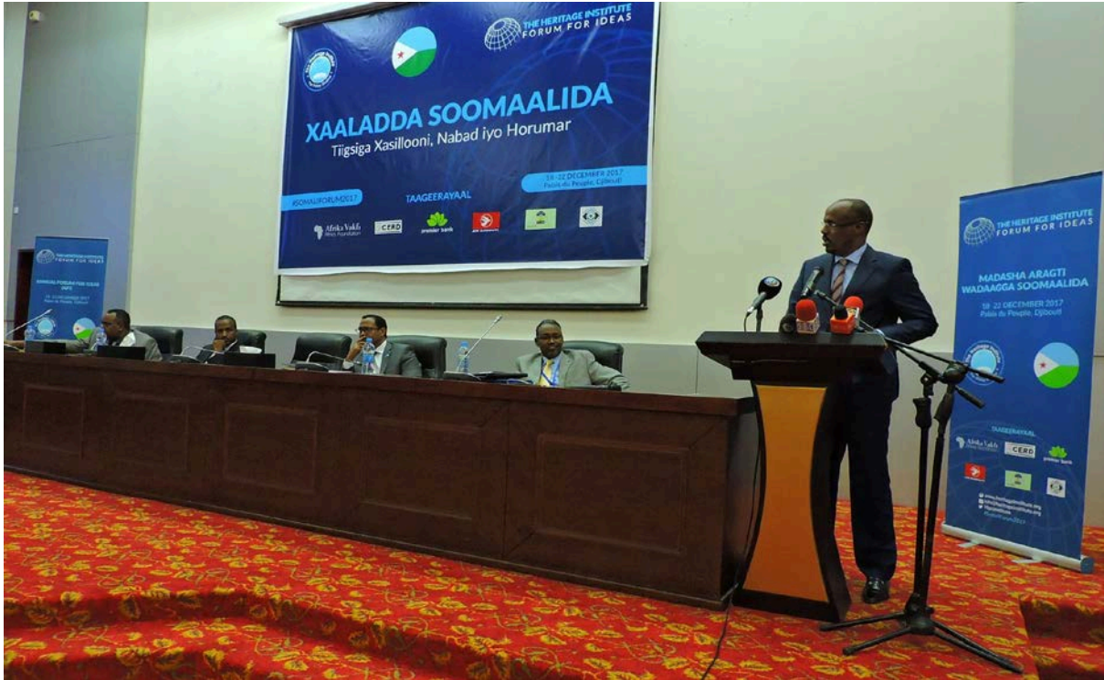
Djibouti Minister of Culture and Islamic Affairs, Moumin Hassan Barre